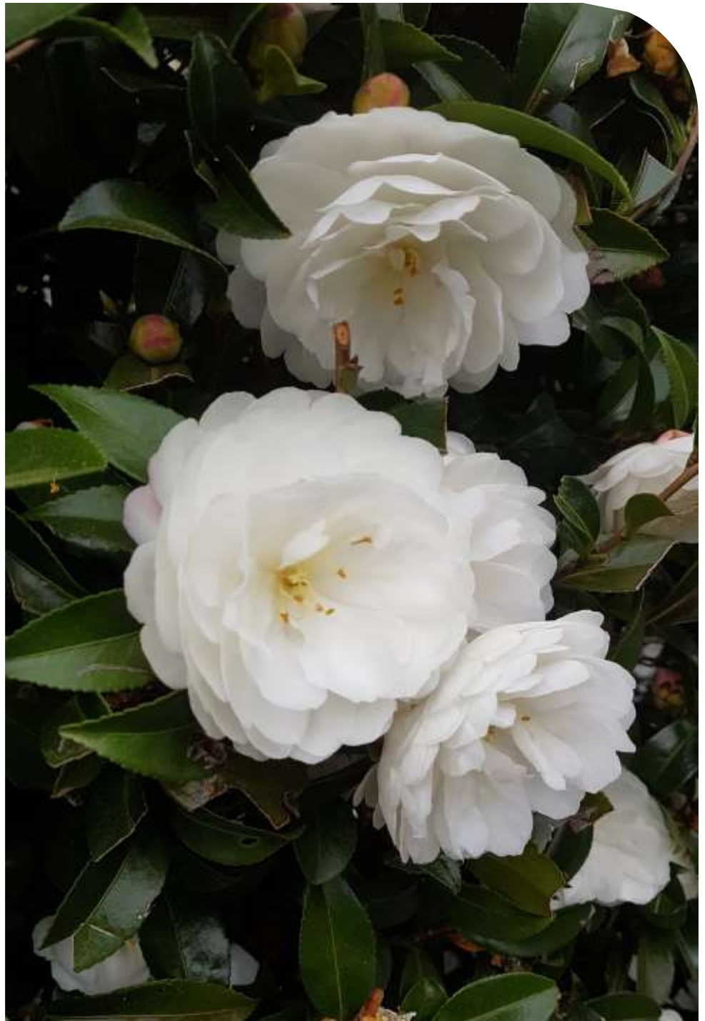
BLOOMING THIS WEEK WHITE SASANQUA HEDGE, KILLARA